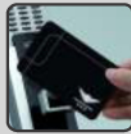
Smart Card (S710FPC Only)